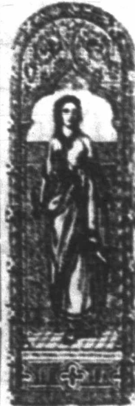
FIGURE and Ornamental MEMORIAL WINDOWS

AND GENERAL Church Glass. — Art Stained Glass For Dwellings and Public Buildings. Our Designs are specially prepared and executed only in the very best manner.