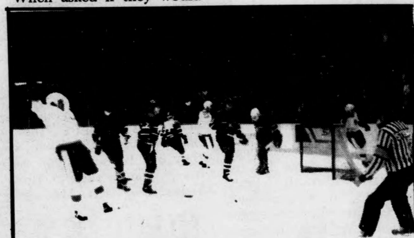
EXPRESS win but train might leave The Express beat Sherbroke last Saturday night to a 2-1 victory. The attendance record was broken, but speculation has it that this might not save the team from leaving.

The Sullivan rink is back to school now and everyone at the Brunswickan congratulates them and wishes them the best of luck in the rest of the term.