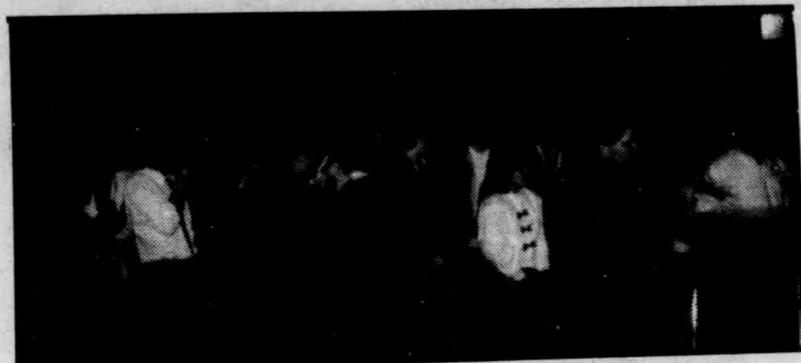
500 people showed up for a reception at the C.W.C.