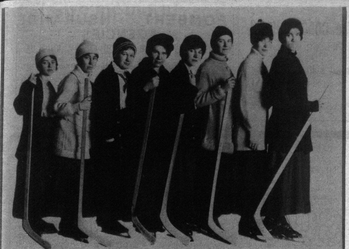
1916-17 "ladies" hockey team.