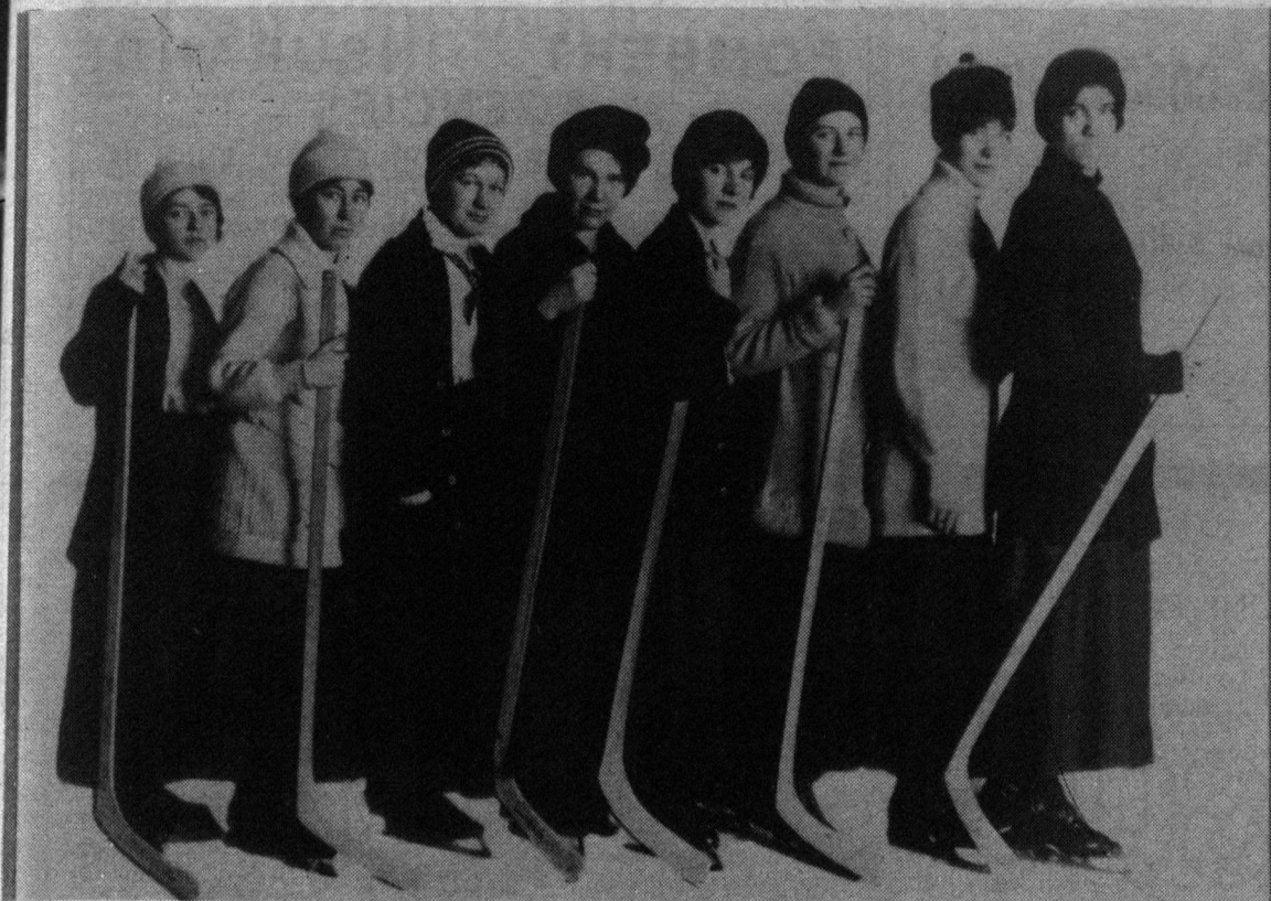
1916-17 "ladies" hockey team.