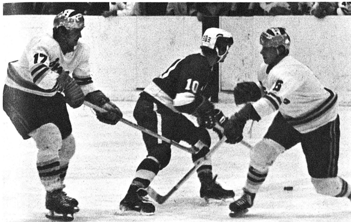
CHECK, CHECK, CHECK WAS THE NAME OF THE GAME ... as the Bears held the Canadian Nationals to three goals

For the Nationals, it was their second win in as many nights. They defeated the University of Calgary Dinosaurs 4-1 Friday night in Calgary.