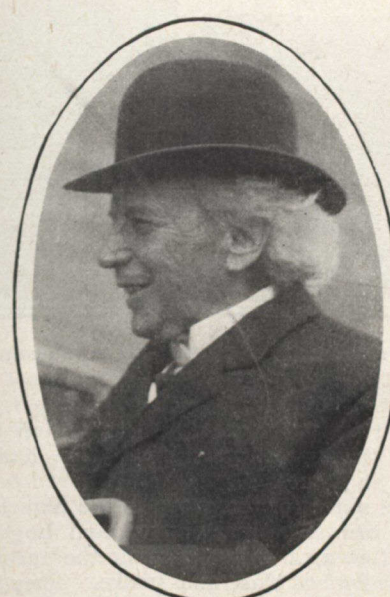
The Promising Premier.

Earl Grey now down the York Factory is the General to the Bay.