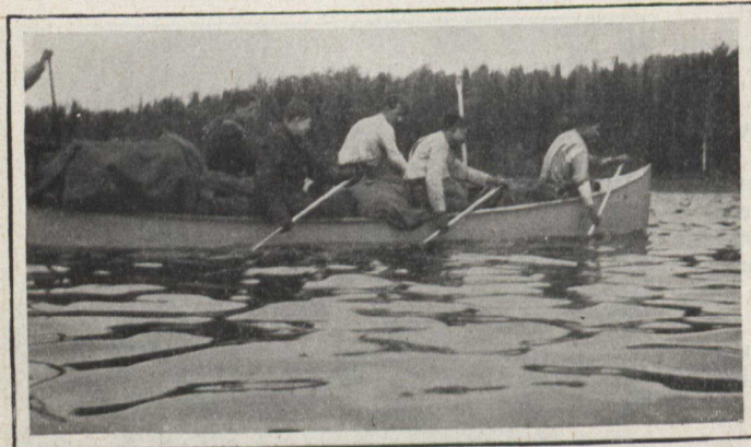
How Earl Grey is travelling down the Hayes River