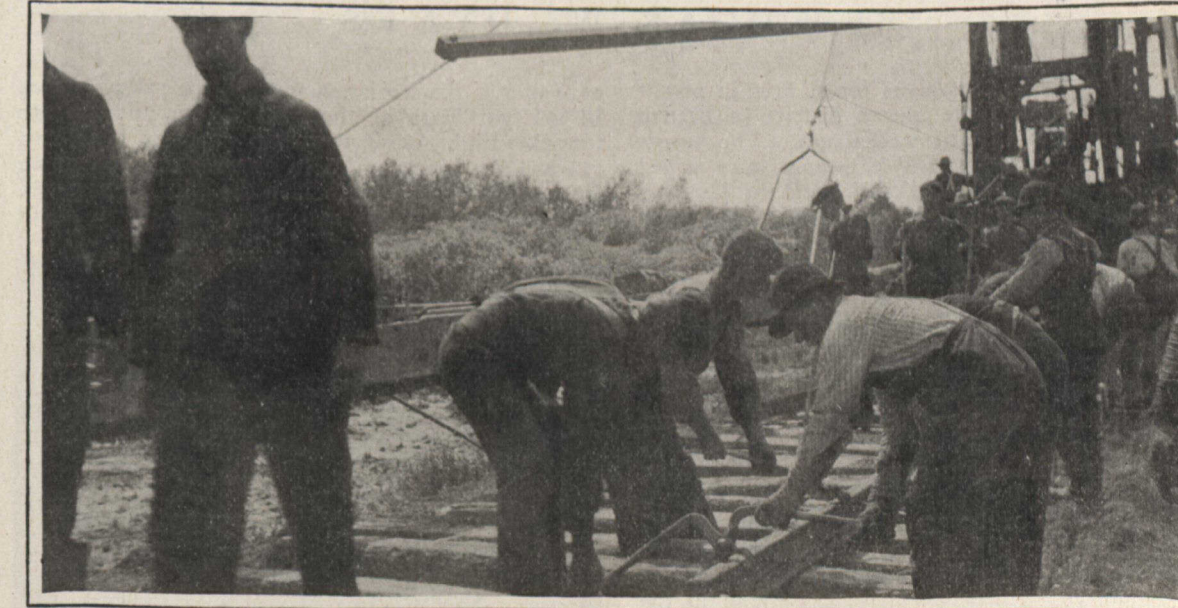
And it won't be long till the track-laying Hercules drives out the dusky Ojibway river man.