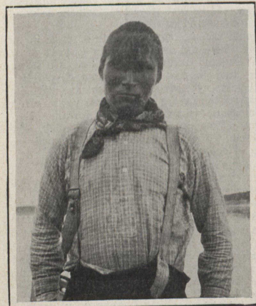
The Ojibway River-Giant's Meditation