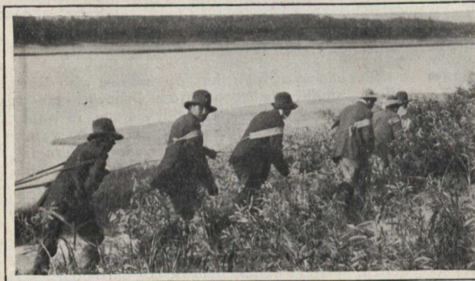
Tracking up a Rapids—instead of a Portage