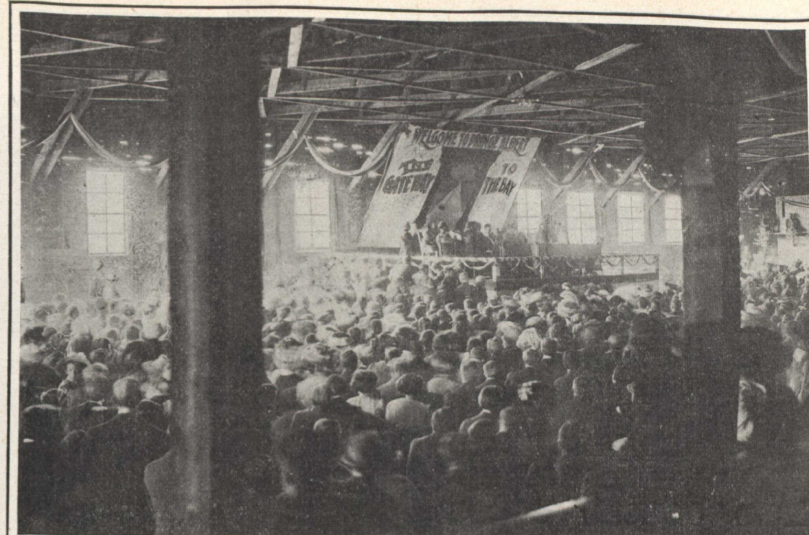
Farmers at Prince Albert—"The Gateway to the Bay"—show the Premier the need of a Hudson's Bay Road

The evidence, submitted to the Senate Committee a year ago, indicated that the shortening of the grain route to