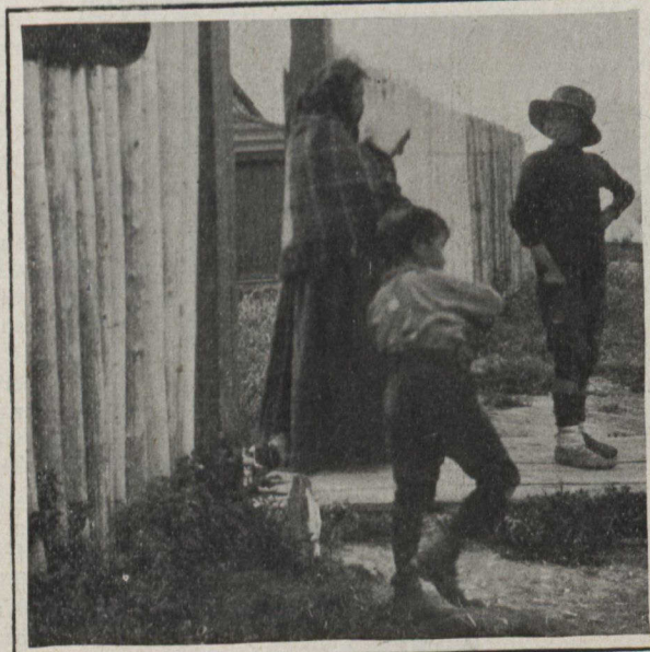
The Old Stockade will soon be crumbling down