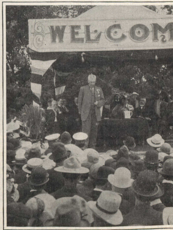
Minister of Railways tells Prince Albert about the road to the Bay

The bard who will write the parody "On the Road to Hudson's Bay," Tune—"On the Road to Mandalay"—will shortly achieve renown. Five hundred and a few odd miles overland from the banks of the Saskatchewan to the edge of the northern sea is just about the river measurement by the tortuous Hayes from Norway House at the head of Lake Winnipeg to York Factory. This voyage will take Earl Grey, now on the way, the best part of twenty days—easy travelling with several portages all of which were marked on the excellent map of the region made by Sir John Franklin long ago. For a long distance north of Prince Albert there is arable land. A picture on the following page shows a field of oats almost man-high growing two hundred miles north of Prince Albert, which will bring the outward fringe of the grain-grower to within three hundred miles or less of the terminus no Hudson's Bay. After that the land is sterile and rocky; almost denuded of game and fur; a vacant, rather desolate land whose chief value to the great middle west will be as an artery for box cars loaded with wheat for Hudson's Bay elevators. "Pelle pro Cutem" has served its day as a motto in that country. The slogan now is—"On to Hudson's Bay."