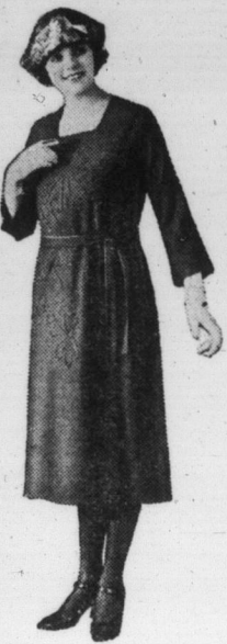
"Adeline" is most fetching in very fine quality, good weight, Botany serge; adorned strikingly with a new all-over design of silk, featuring narrow band of gold material with streamer ends; new flare sleeves; dress done in black. $14.50 splendidly tailored.