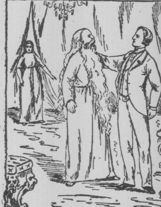
"THOU ART A MAN."

The figure thus addressed moved slowly, vacantly as a sleepwalker, rewhite silk. This Zanea wound around