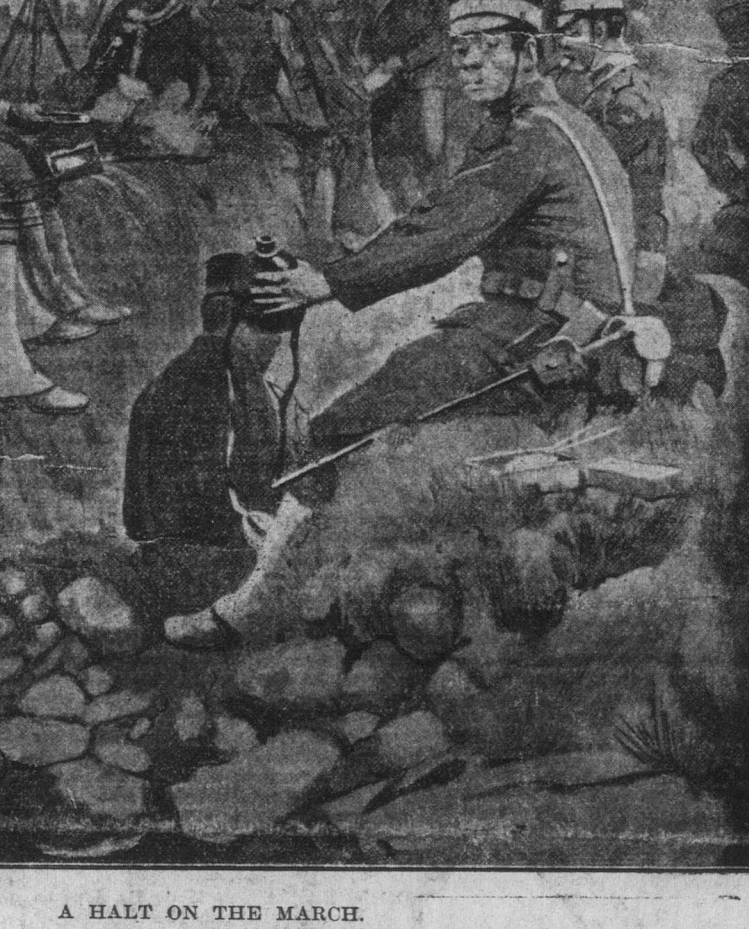
Japanese Troops Resting For Rations.