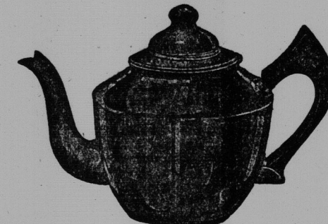
8 Cup Coffee Percolator Only $4.75

These New Goods, bought direct from the manufacturers, are being unpacked as this advertisement goes to press.