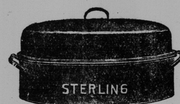
17 Inch Self-Basting Roaster $5.25