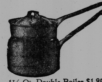
1 1/2 Qt. Double Boiler $1.95