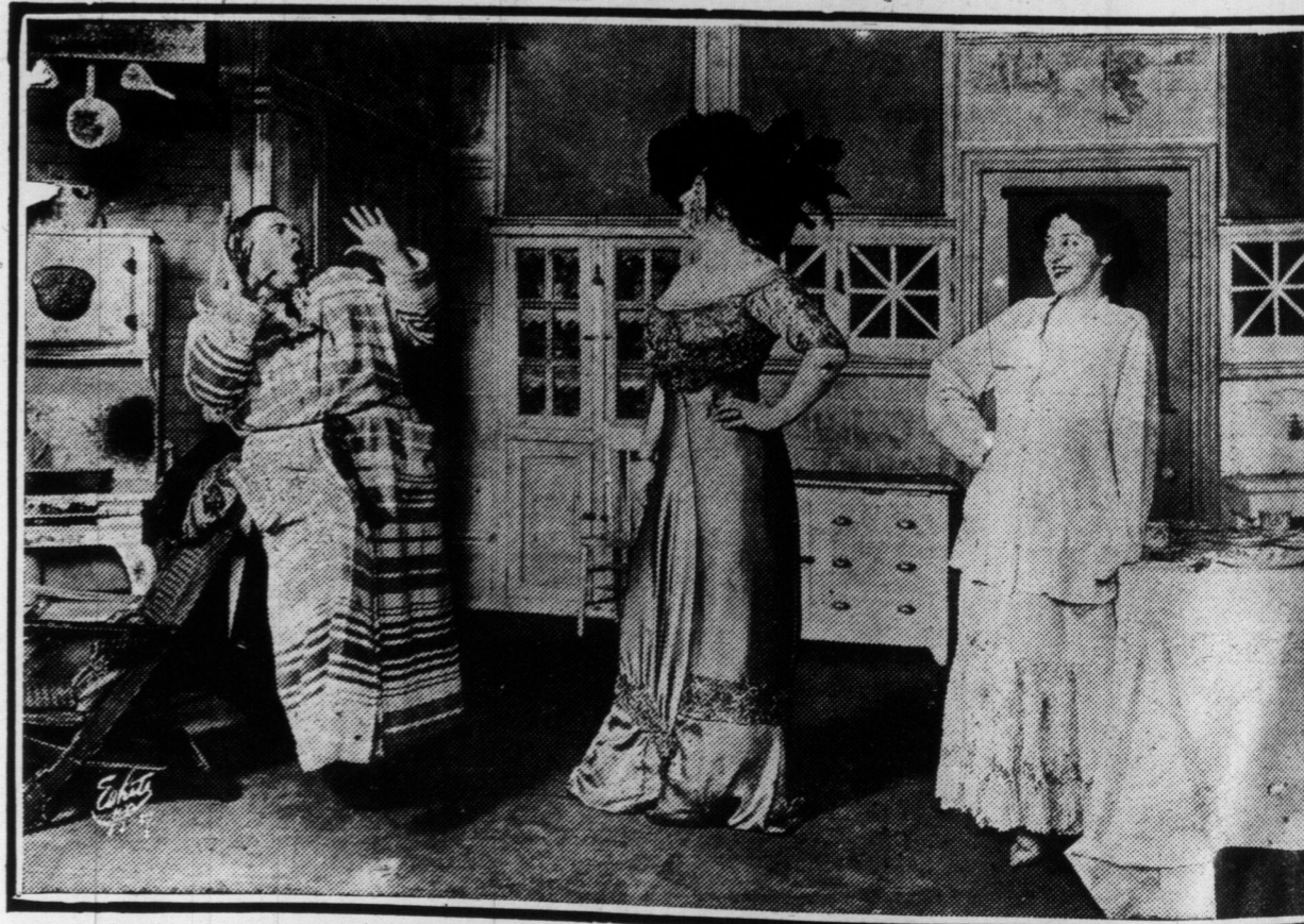
SCENE IN ENGLAND'S GREATEST SUCCESS, "SEVEN DAYS," THE OFFERING AT THE GRAND OPERA HOUSE THIS WEEK.