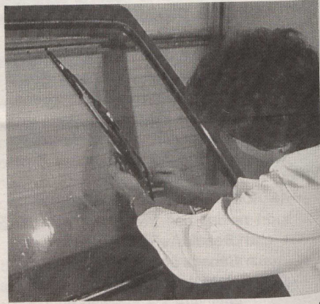
Tridon conceived and developed the first non-metallic wiper blade ever used as original equipment.