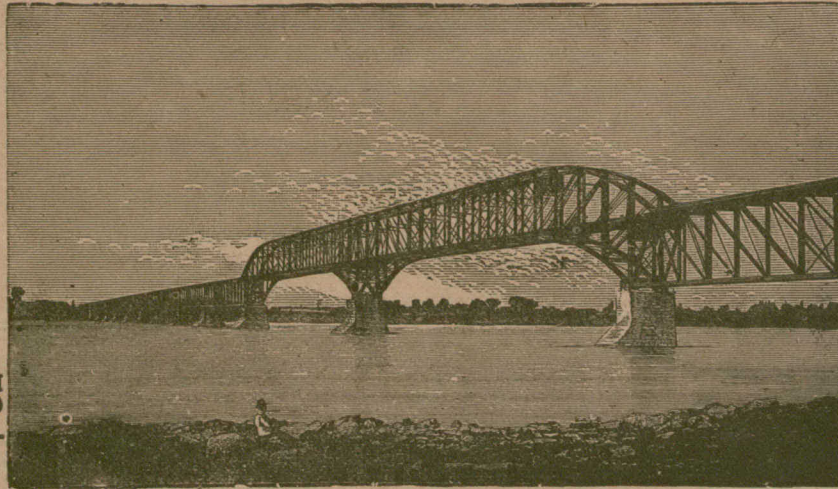
ST. LAWRENCE RIVER BRIDGE, CANADIAN PACIFIC RAILWAY, LACHINE P. Q.

The cost of Metal Bridges, for a term of years, is less than the cost of building repairing and replacing wooden bridges, and believing the only reason so many bridges are still built of wood to be that those who are charged with the duty of contracting for them are not aware how little difference there really is in the first cost of a good Iron or Steel Bridge and a well-built wooden one, of equal strength, we are at all times pleased for an opportunity to quote prices to officers of counties, cities and townships, so that they may intelligently compare the cost of metal and wooden bridges. To enable us to name prices closely we need information on the following points: Number of spans and length of each span. Width of roadway and number and width of footways and sidewalks. Kind of Lumber to be used for floor joists and plank and its value. Name of nearest R. R. Station and distance of bridge site from station. Depth of water at ordinary level and height of floor above water. Also strength and capacity of bridge required, if any particular strength has been determined on; or a general statement as to the nature of travel over the bridge; whether on a country road, a well-ballasted turnpike, or located in a village or city, and subject to heavy loads.