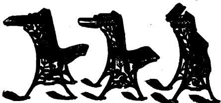
THE "MARVEL" SCHOOL DESK,

The Canadian Office and School Furniture Co., Limited, Successors to W. STAHLSCHEIDT & Co. Manufacturers of Office, School, Church and Lodge Furniture