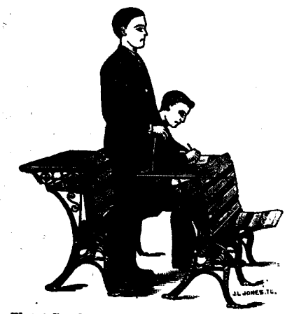
The "Perfect Automatic" School Desk The Latest and Best

Preston, Ont. Successors to W. Stahlschmidt & Co.. Manufacturers of Office, School Church and Lodge Furniture.