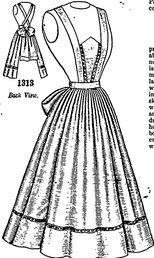
1313 Back View.

LADIES' COMBINATION CORSET-COVER OR CHEMISE AND CLOSED OR OPEN FRENCH DRAWERS. (TO BE MADE WITH A HIGH, V OR ROUND NECK AND WITH FULL-LENGTH COAT SLEEVES OR WITH SHORT PUFF SLEEVES OR WITHOUT SLEEVES.)