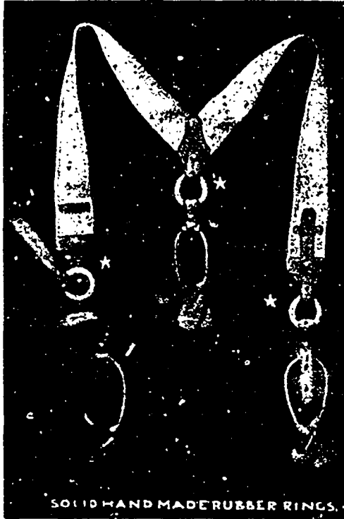
SOLID HANDMADE RUBBER RINGS.

NO BACKS, ENTIRELY NEW PRINCIPLE, ABSOLUTELY UNPARALLELED FOR COMFORT, EASE OF ADJUSTMENT, AND PERFECT SIMPLICITY. WORN BY THE LEADING SPORTSMEN, ETC., OF THE DAY. MANY LEADING HUNTERS WHO ARE MAKING A SPECIALTY OF THIS BRACE SPEAK HIGHLY OF THE BENEFITS DERIVED THEREFROM. HUNTERS, OUTFITTERS AND SPORTING TAILORS SHOULD WRITE FOR FULL PARTICULARS TO