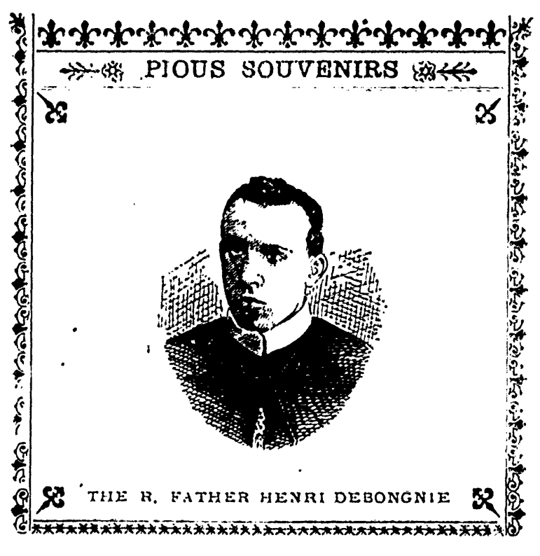
->>->> The young apostle Offer for