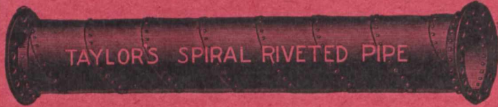
TAYLOR'S SPIRAL RIVETED PIPE