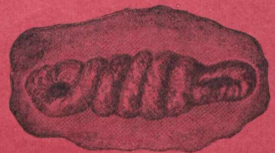
A Strand of Lead Wool coiled up for transit