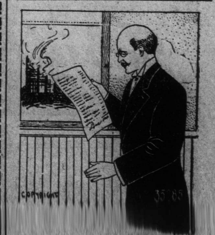
FIGURE UP THE LOSS

People who find it hard to drink milk will find it much easier to take the milk through a straw.