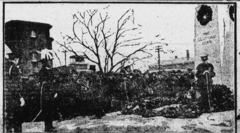
Lord Byng of Vimy, Governor-General of Canada, attending the unveiling of Montreal's Cenotaph to the "Unknown" on Armistice Day, 1921. Lord Shaughnessy is seen leaving the Cenotaph after having placed a wreath.