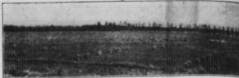
A Harvest Scene, Experimental Farm, Indian Head.

WHEN WRITING TO ADVERTISERS PLEASE MENTION THE GUIDE