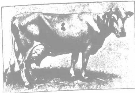
Pontiac Rag Apple (58980).

The largest sale of high-class registered Holstein cattle ever held in Canada will take place at the