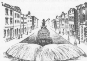
Studebaker Sprinkler (PATENT IMPROVED.)

Does not clog or get out of order. Greatest width of spray Can be graded from driver's seat to any volume. We also make an . . .