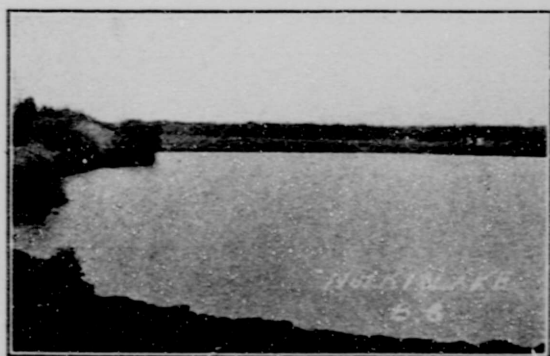
Nulki Lake, West of Prince George.

but few of the leguminous plants, and especially red clover, can or will propagate or even live where the moisture content of the soil at any stage of its growth falls below 15 per cent. But the disposition or ability of said plant to hold and flourish in the soil here year after year places this portion of the country almost in a class by itself, neither burning up in the summer nor freezing out in the winter.. We know of no other portion of Canada (or it might be said of the north temperate zone) where there is such a uniformly distributed precipitation—moderate, yet generous enough to meet all growth requirements. And also, thus carrying within and of itself, through its own legume-producing qualities—the best of the elements for its own soil upkeep and upbuilding—while at the same time producing