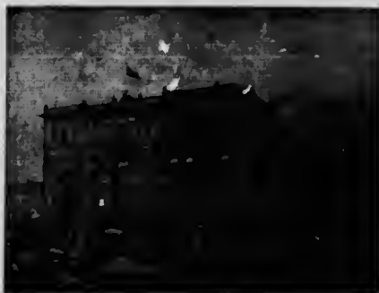
The King Edward, Toronto.

The launch illustrated here is one made by the Gasoline Engine Company of Toronto Junction. The engine is installed under the floor, and works