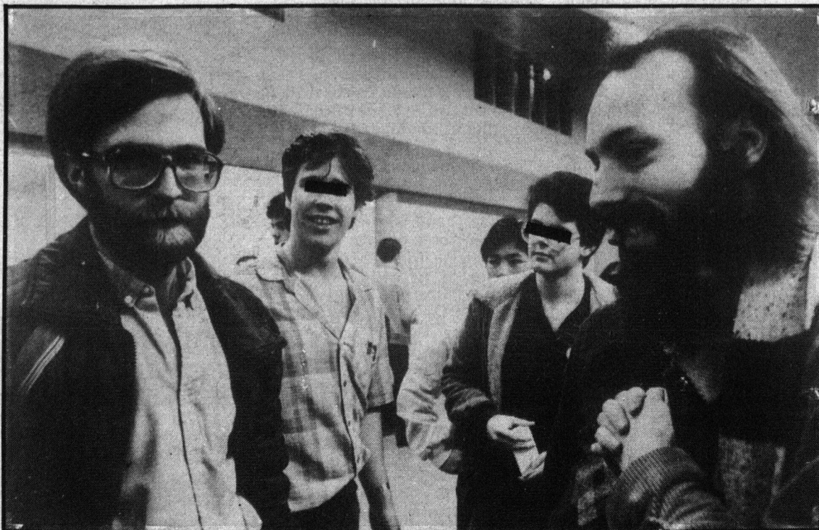
"Clash of the Titans"