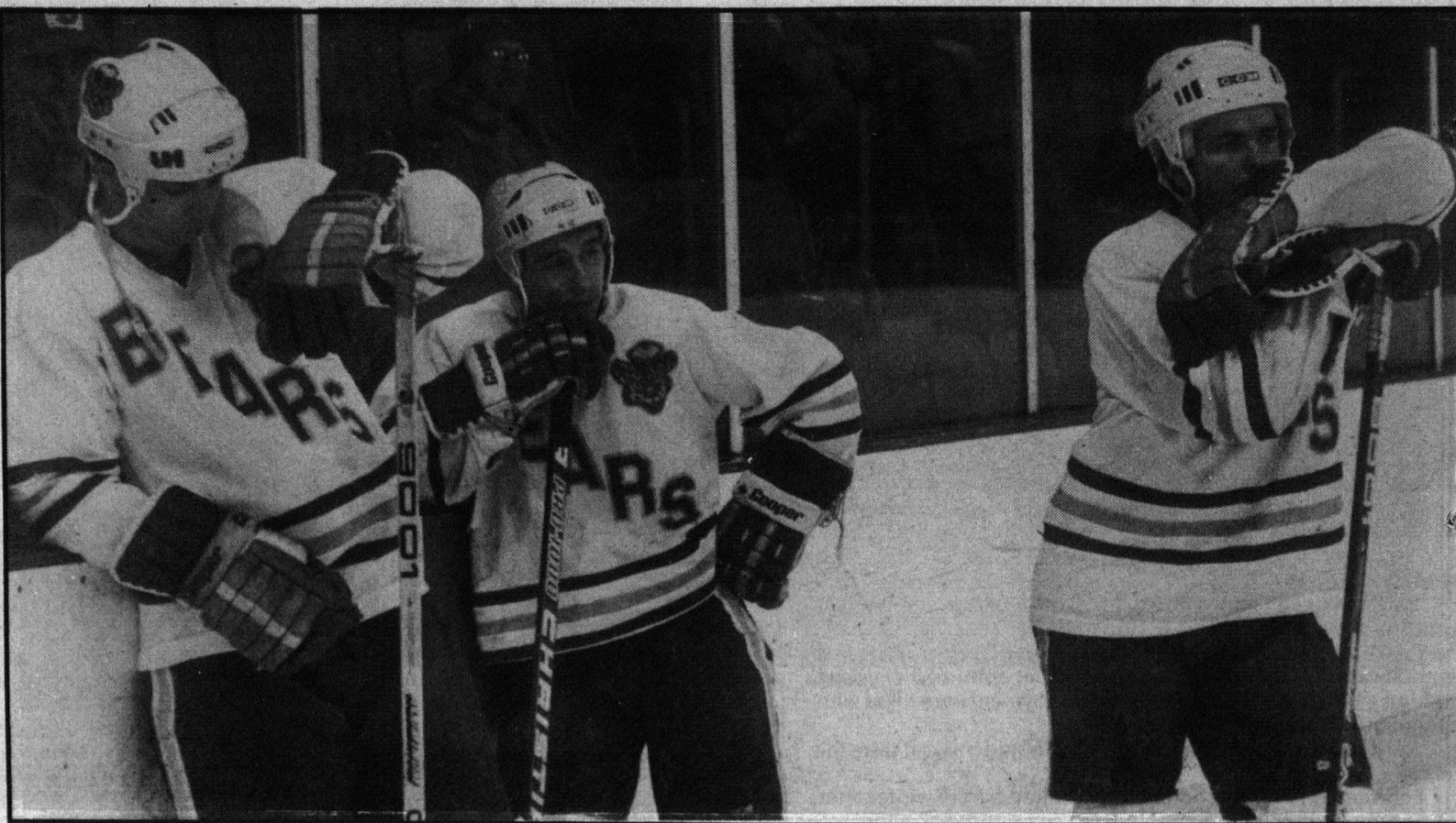
The Bears couldn't do it in Trois-Rivieres.