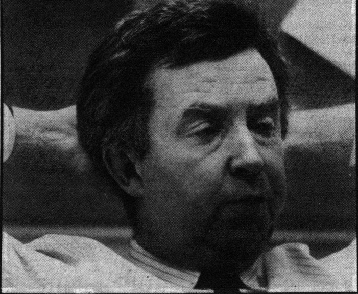
"I'm at which University?"