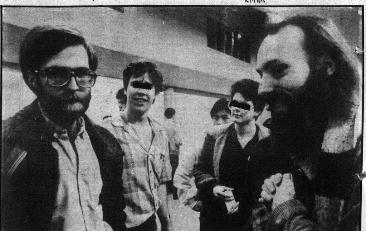
"Clash of the Titans"