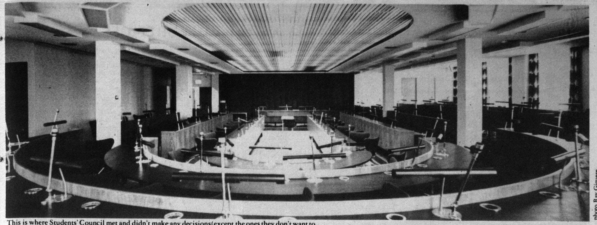
This is where Students' Council met and didn't make any decisions (except the ones they don't want to