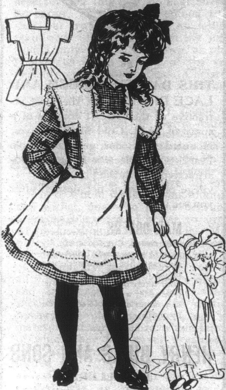
Girl's Apron with Belt.

No. 4486.—An exceedingly pretty apron is shown here in an original design, made up in lawn and edged with embroidery. The apron is in one piece and slips on over the head. This means a saving in the labor of making, for there are no buttons and buttonholes, and no back opening. A narrow belt is worn with the dress and, if desired, pockets might be added. Aside from the simplicity of the design and make, anyone can see at a glance how easily a gar-