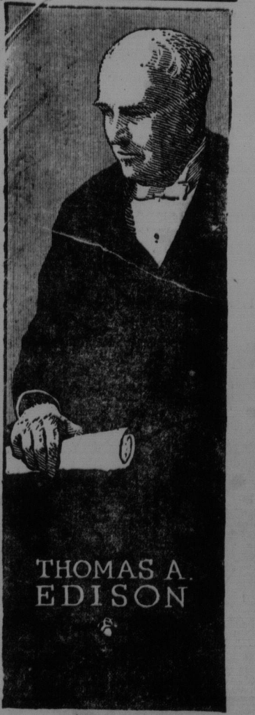
THOMAS A. EDISON