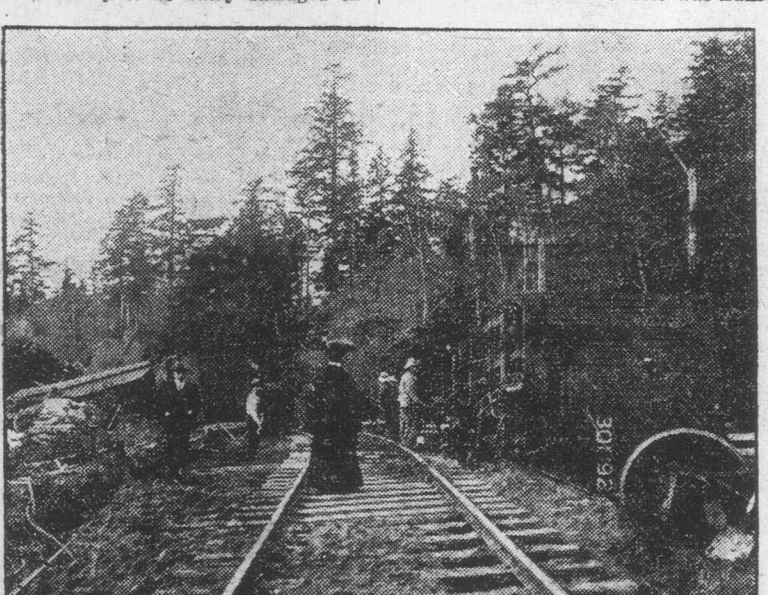
ANOTHER VIEW OF WRECK.

All the other cars were tumbled over goods. Among the consignees represented in the lot are Lenz & Leiser and G. New rails and fies were taken onto ground, and a gang of men kept busy laying a new track on the outside of the are not likely to be badly damaged ex- bed. All the ballast available was trans-