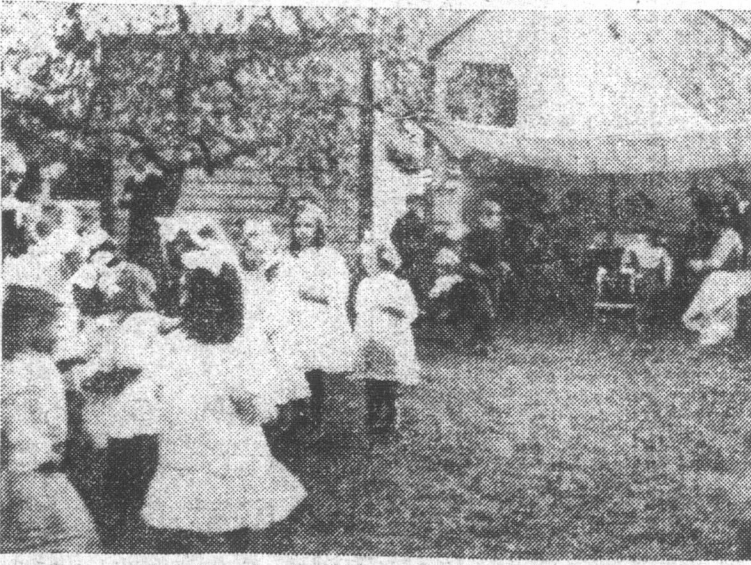
Scene at a lawn party held on the Victoria West Methodist Parsonage grounds on Tuesday last, April 26th.