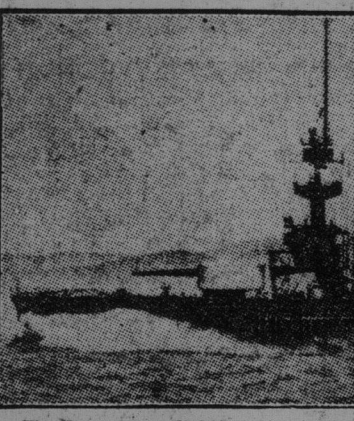
The French battleship Liberte which blew up and sank at Toulon the other day with a loss of nearly 800 French men, women and children.

Toulon, Sept. 27.—(Canadian Press)—The authorities are occupied in re-establishing the cause and the responsibility for the disaster to the battleship Liberte, and to devising a means to prevent a recurrence of such accidents. M. Delcasse, the minister of marine, who visited the wreck today, was affected to tears at the dreadful sight. It is said that he was exceedingly angry and vehemently criticized the defective organization, which was not adapted to modern progress, evidenced of which met him at every turn. M. Delcasse said it was not delinquency of "B" powder that was responsible for the explosion. The cause, he said, was to be sought elsewhere. He warmly congratulated the captain of the battleship Republic for his presence of mind in fleeing his magazines from the blast, and the first explosion on the Liberte, saying that he was quite at a loss to understand why the commander of the battleship, Brennus had once been censured for similar inactivity. An officer of the Liberte expressed the belief that the fire was smoldering for a long time. It gradually heated the partition which had been built up in the main port. No fatalities have been reported.