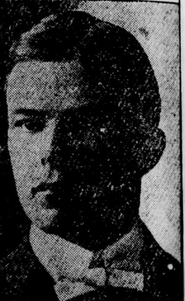
R. W. MORGAN SHUSTER.

How did an American master make so much trouble for Persia and Russia? Who is Mr. Shuster, anyway? William Morgan Shuster is an American lawyer, thirty-five years old, who was appointed Treasurer-General of Persia about a month ago, on recommendation of President Taft.