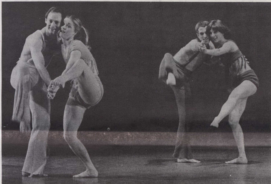
Contemporary Dancers in a scene from Country Music.