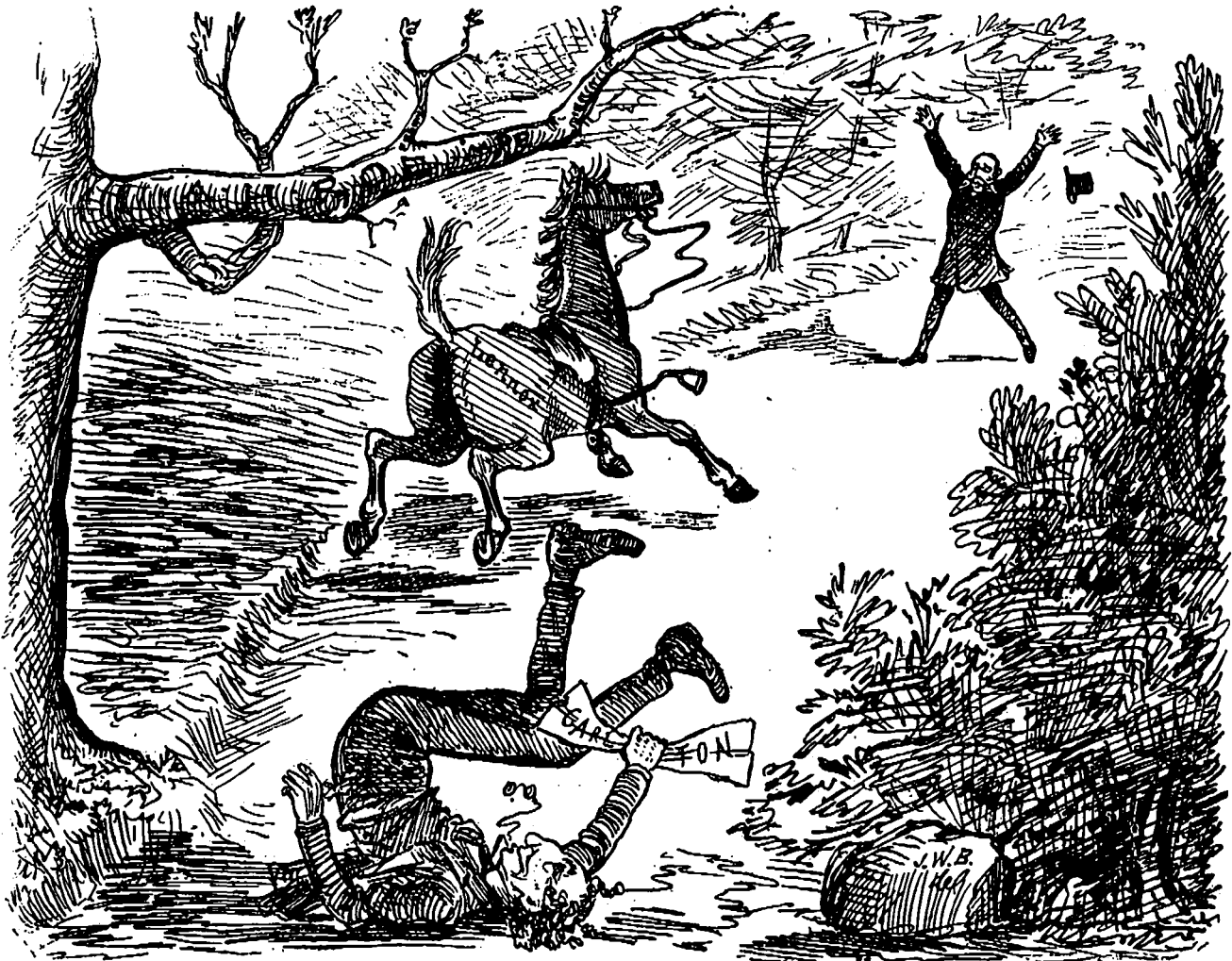
WILL HE CAPTURE THE HOSS ?