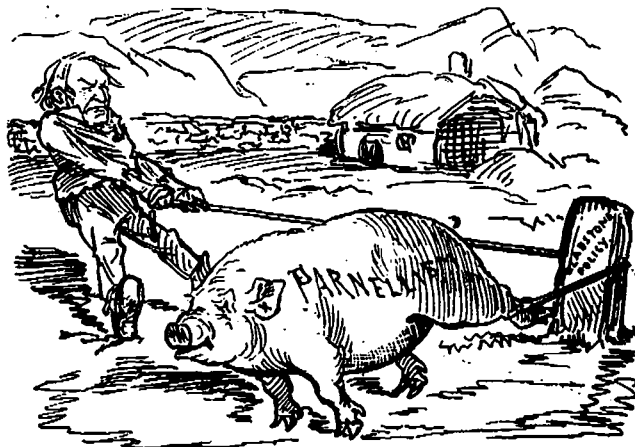
THE IRISH DIFFICULTY: ILLUSTRATING THE PRESENT POSITION OF AFFAIRS.