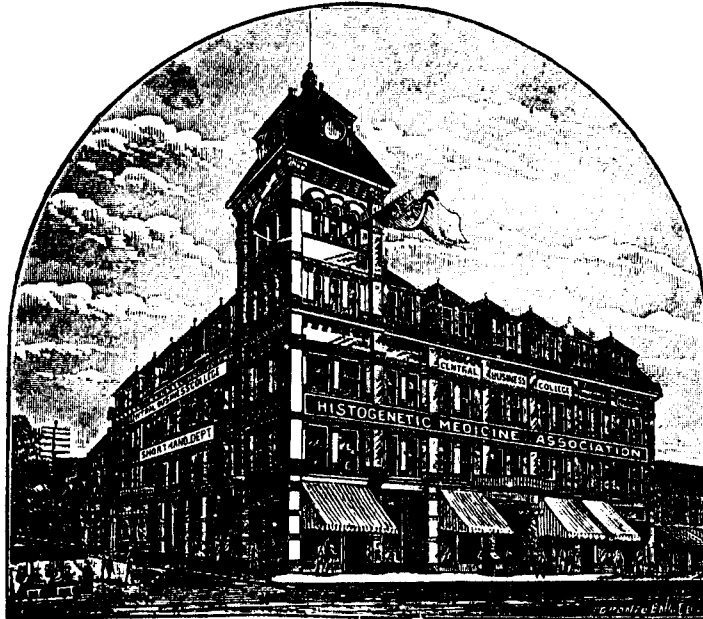
Gerrard Arcade, Toronto

All diseases successfully treated by the new system of pure and tasteless medicine. So-called incurable cases preferred.