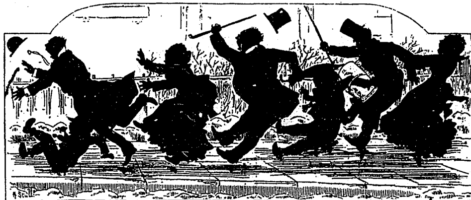
A small boy marched at the head of the line and they managed to keep their feet. But he slipped and fell, with an agonized yell, and they sprawled all over the street. WHAT A LITTLE CHILD CAN DO.