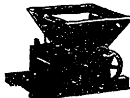
No. 1 Power Grater. Grinding Capacity: 400 to 600 bushels per hour.