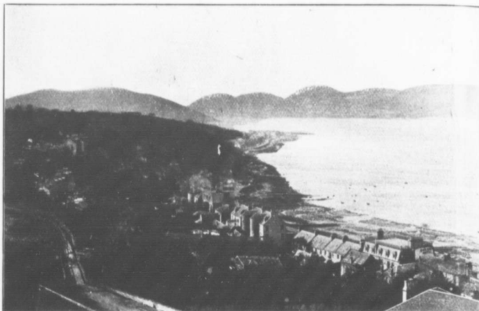
ARDBEG AND THE COWAL HILLS, ROTHESAY.