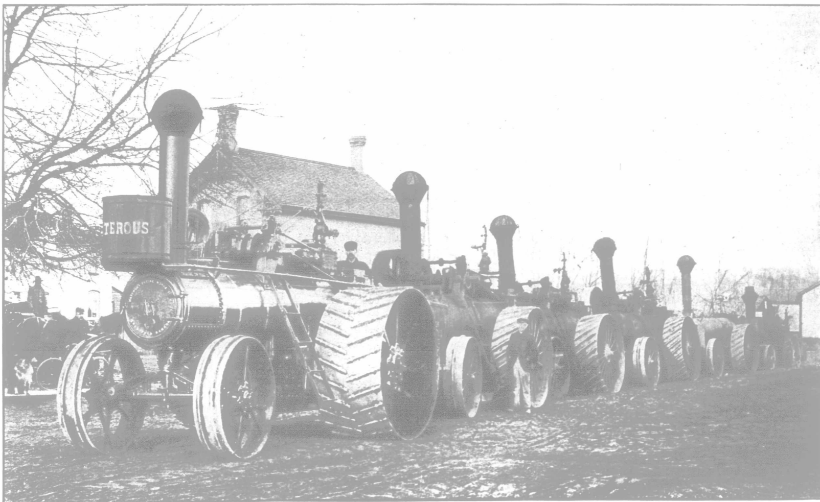
WATEROUS PLOWING ENGINE DRAWING 91480 LBS. ACTUAL WEIGHT

In answering the advertisement on this page, kindly mention the FARMER'S ADVOCATE.