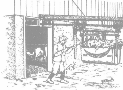
The Superior Way

Superior Barn Equipment Co. Fergus, Ontario