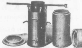
Moulds and the Tile they make.