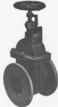
Indicator Gate Valve.

Railway Supplies, Structural and Ornamental Iron Work