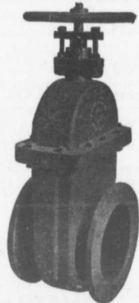
Flanged End Gate Valve with Hand-Wheel.

Special Castings of all kinds Valves Hydrants