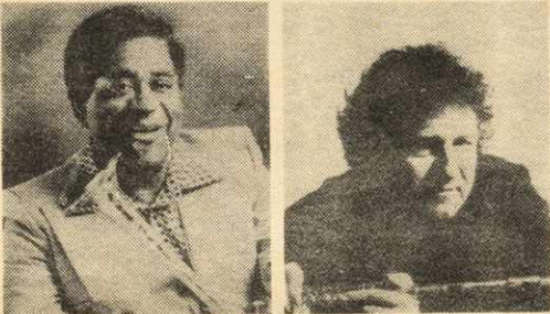
Dizzy Gillespie & Moe Koffman SUNDAY, APRIL 14, 8 PM