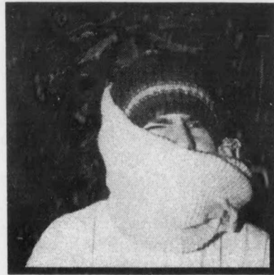
Little Debbie - snack cakes