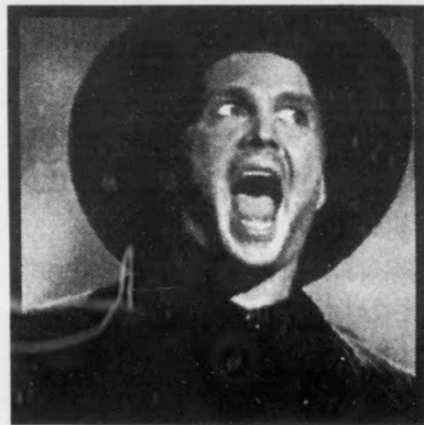
Garth Brooks - entertainer V

Sittin' on the American Music Awards trophy. Boy it sure is pointy and all.