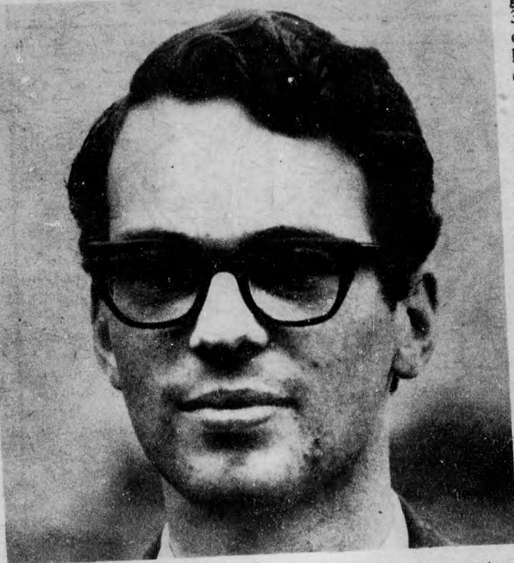
AMONG THE DUTIES of the council president listed in the constitution is this item: "Be responsible for a due observation of the Act of Incorporation, the Constitution, and the By-Laws."

13. Even if students do manage to show that a candidate is not satisfactory, he may run in the next election; they cannot deny him the right to re-offer the way council can. The president may even rule that a student is not qualified to run.