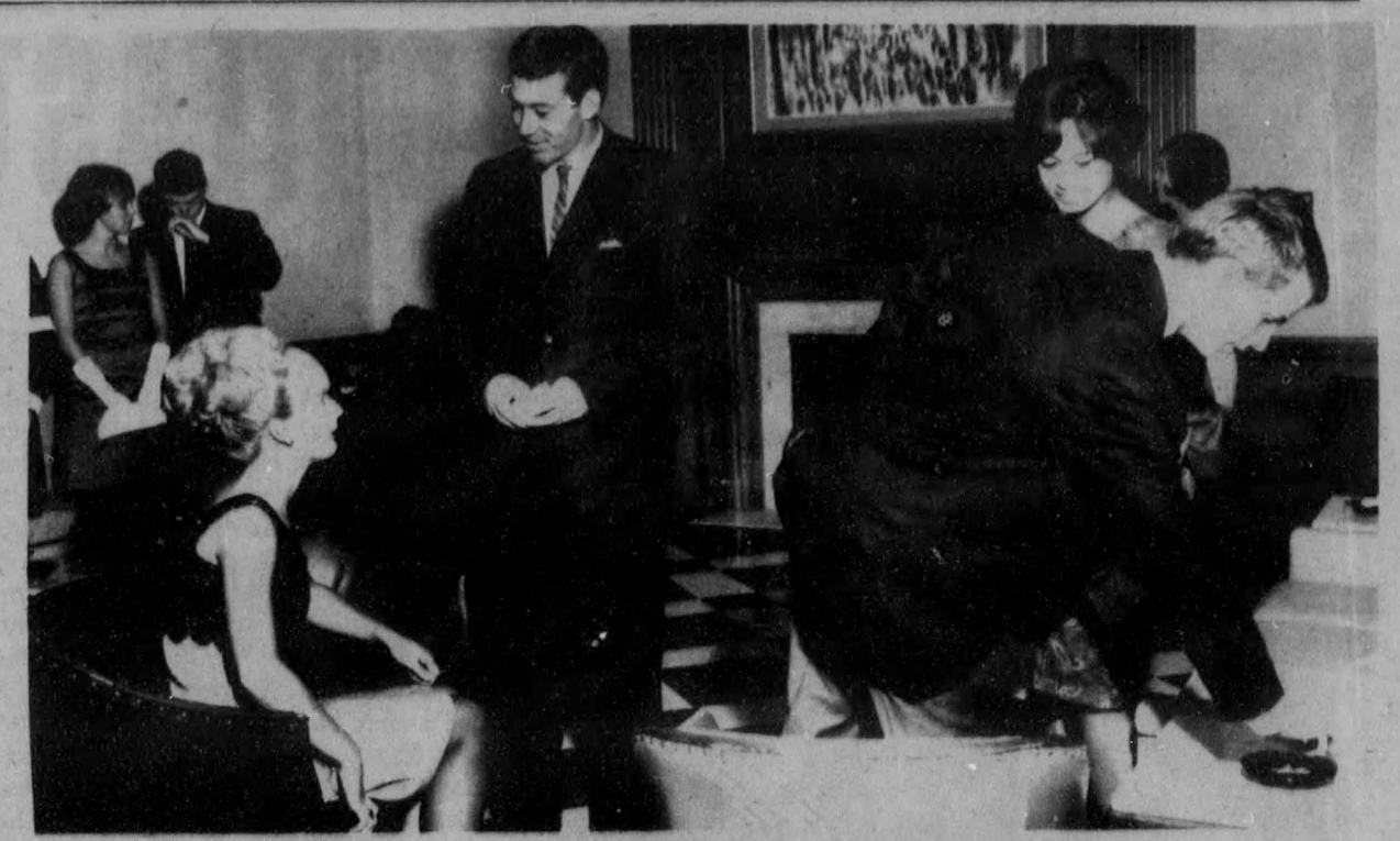
"Excuse me Miss, do you have any cigarette butts? We're collecting."

If colds and injuries can be avoided, the '66 edition of the Red Harriers should be considerably stronger than last years aggregation.